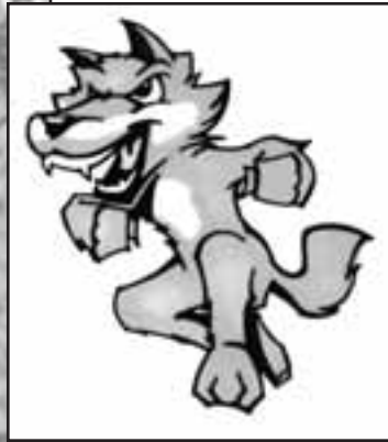
Cuyamaca College's first official Coyote Mascot.