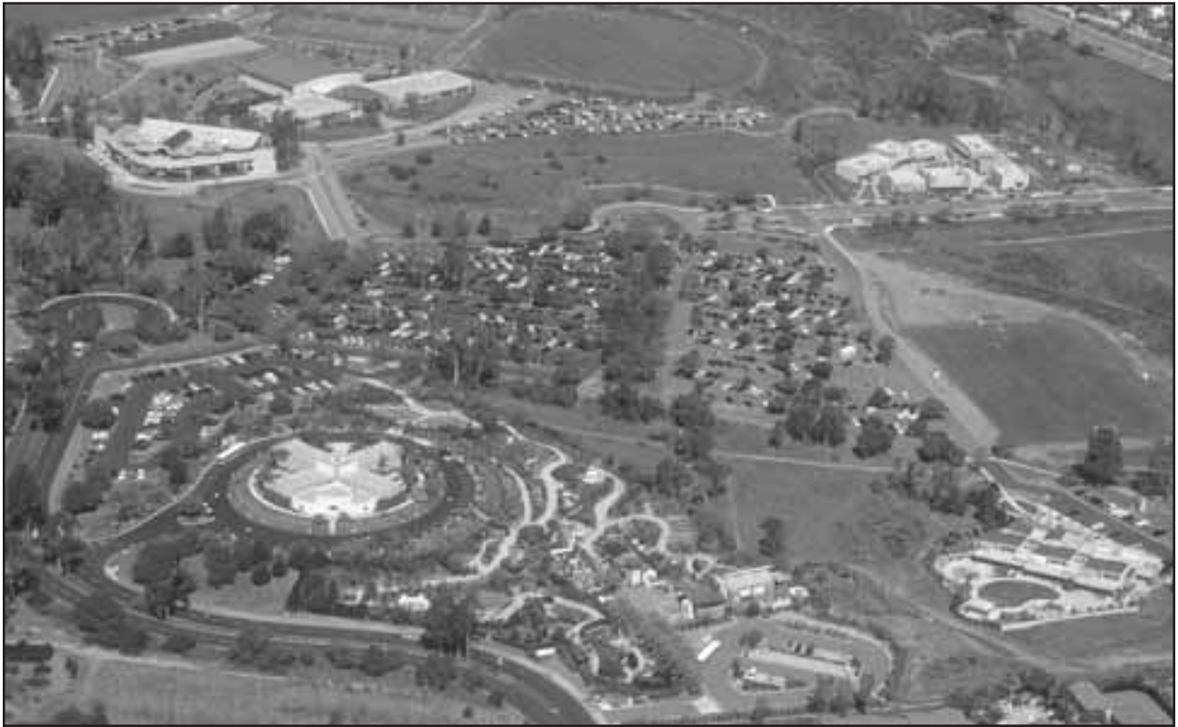
March 2003 aerial photo